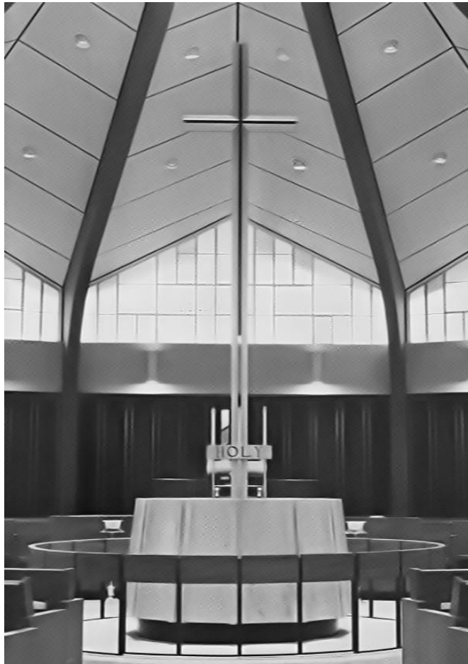
Photo of the Prince of Peace sanctuary from the May 16, 1965 Dedication Program

"When it comes to church buildings, never trust an architect." Those were the words of one of my Seminary professors. He held the opinion that most architects